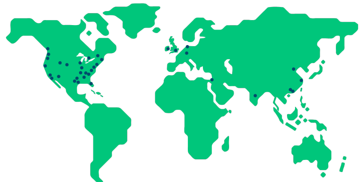
● SVB's Offices

Learn more at svb.com/uk/foreign-exchange or contact us at EMEAFXTraders@svb.com