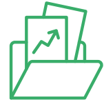
FX Spot, Forward, Option and Swap contracts