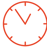
24 Hour Market Orders