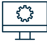
Online FX Trading