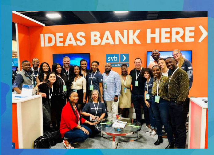
SVBers attend the 2019 AfroTech Conference

We administered our first firmwide diversity and inclusion survey in 2014 and regularly include questions related to belonging and inclusive culture in our employee engagement surveys. We also conduct focus groups to solicit employee feedback. These efforts inform SVB's diversity, equity and inclusion strategy, ensuring our initiatives reflect our employees' priorities.