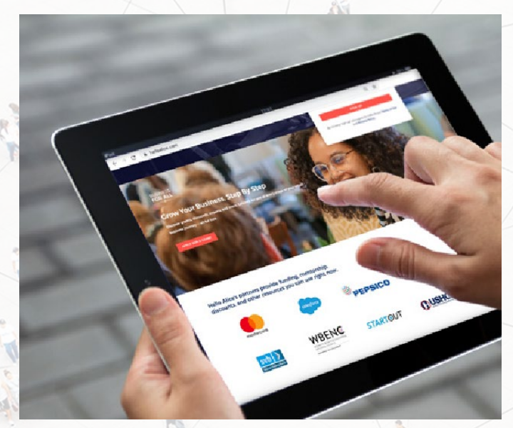
Hello Alice website (helloalice.com)

Grameen America provides microloans and training to women in poverty who seek to build small businesses. SVB has committed $2 million in loan capital to help launch women-led businesses. Since 2012, Grameen America's San Francisco Bay Area offices have made loans to 11,094 women totaling $124 million and creating 11,700 jobs.