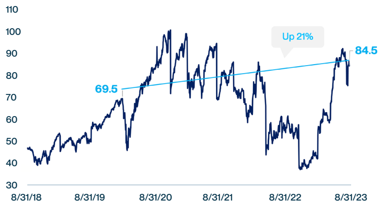
Chart 1: DJUSSTH Index price-to-earnings ratio

The divergence between P/E and P/S ratios over a period in which the DJUSSTH Index appreciated 29% 2 gives rise to two important insights. First it implies that earnings have been a more important driver of stock prices. And two, organic top-line growth has not translated to higher valuation multiples for this segment of stock market, a clear departure from previous sentiments.