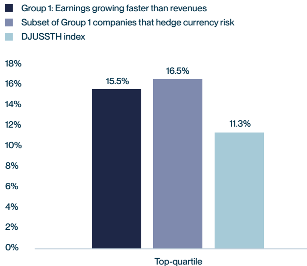
Chart 4: Equity performance since Q2 2023 start